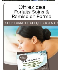
Choisissez, et Cochez simplement la case BON CADEAU