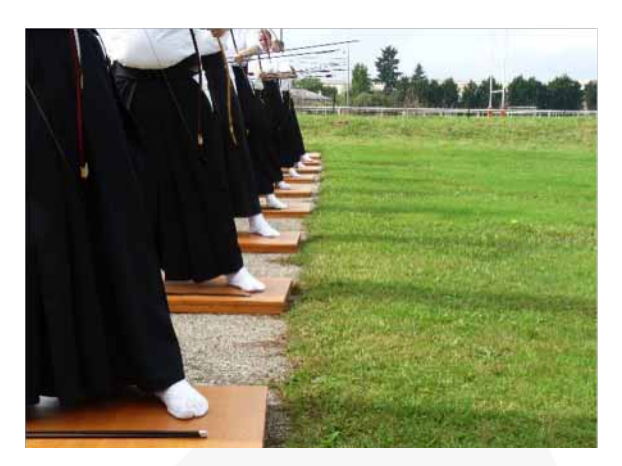
Floor units for 9 shooters in a row

Tournan-en-Brie city stadium - Rpt C. Santarelli Rte de Fontenay - 77220