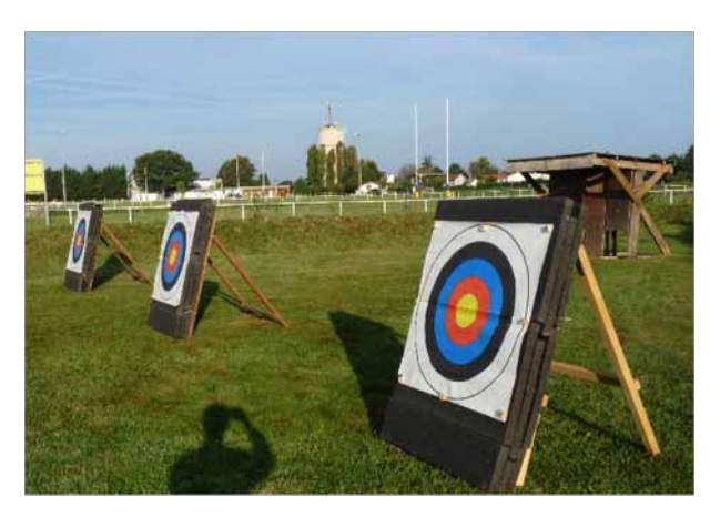
3 targets at 60m

From Gare St Lazare or Gare du Nord : RER E, 50 mn (Magenta). A train every 30 minutes. Double check the train destination is Tournan.