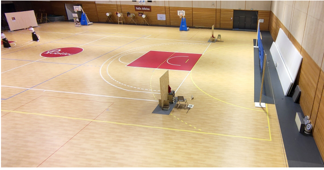
The local club "Kyudo Chablais" practices there every week and will install 5 shajos in two communicating rooms. Above, the smallest.

Translations: If necessary, volunteers from the organizing committee will translate from/to French/English, French/German, possibly French or English/Spanish.